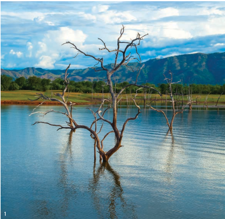
1. LAKE KARIBA 2. CASCADES SAFARI LODGE

Our ships and lodges are available on both FIT & Charter basis.