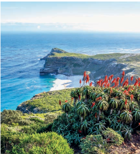
THE CAPE OF GOOD HOPE