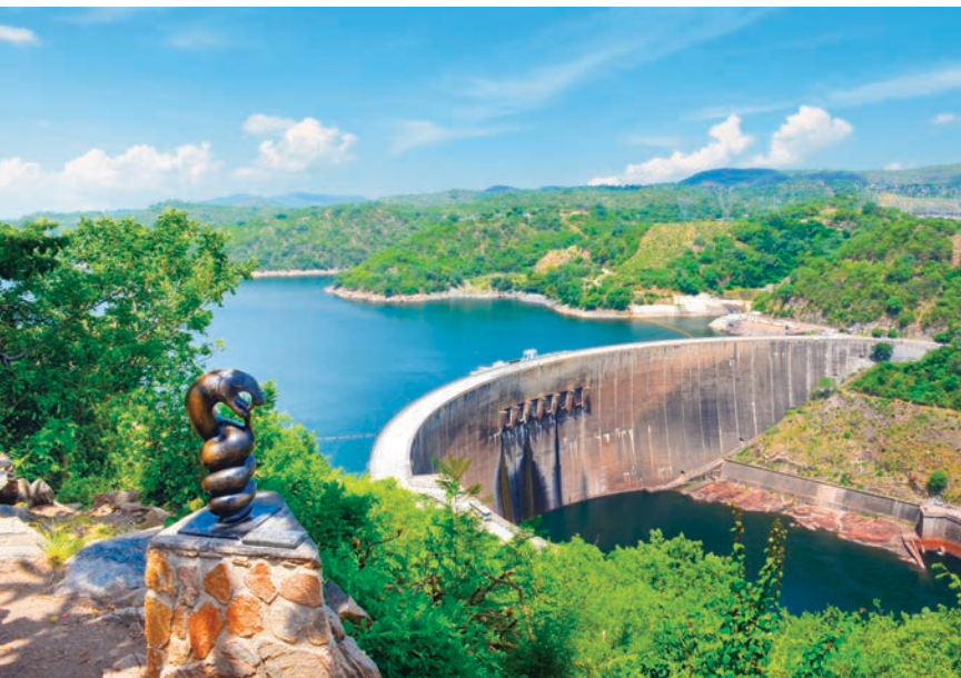
LAKE KARIBA DAM