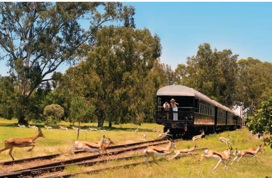
ROVOS RAIL, LUXURY TRAIN

EXPLORE SOUTHERN AFRICA ON BOARD A LUXURY TRAIN, THE ROVOS RAIL